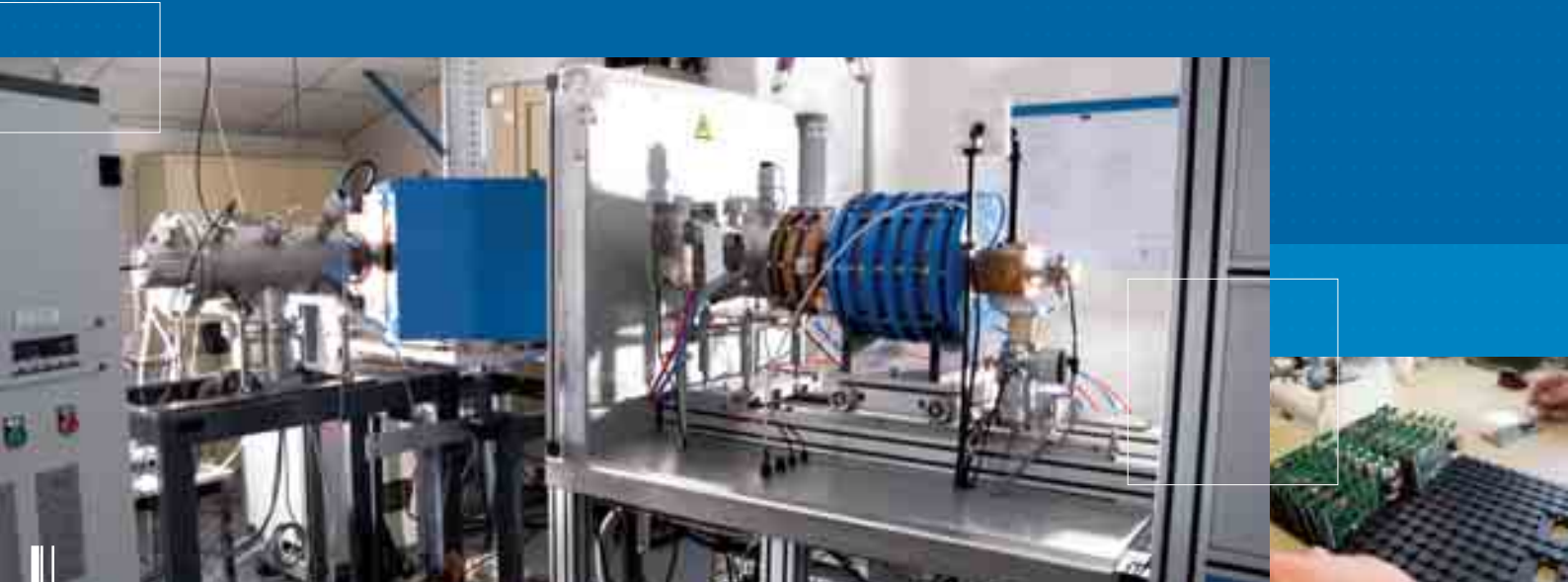
ECR ion source bench / Customer: Panttechnik